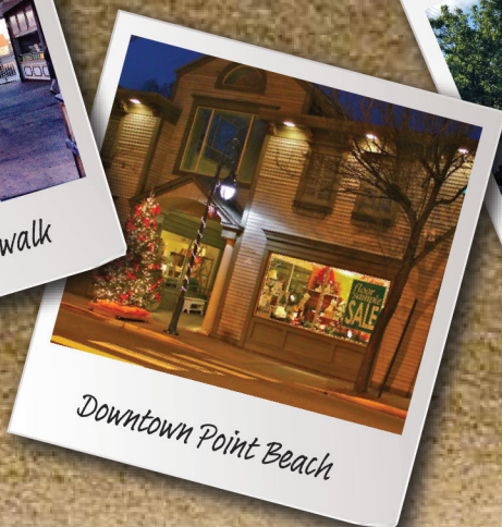
Downtown Point Beach