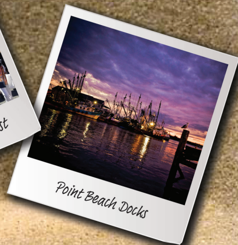
Point Beach Docks