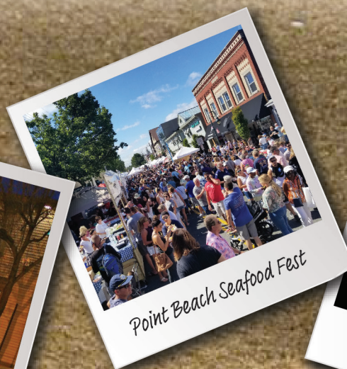
Point Beach Seafood Fest